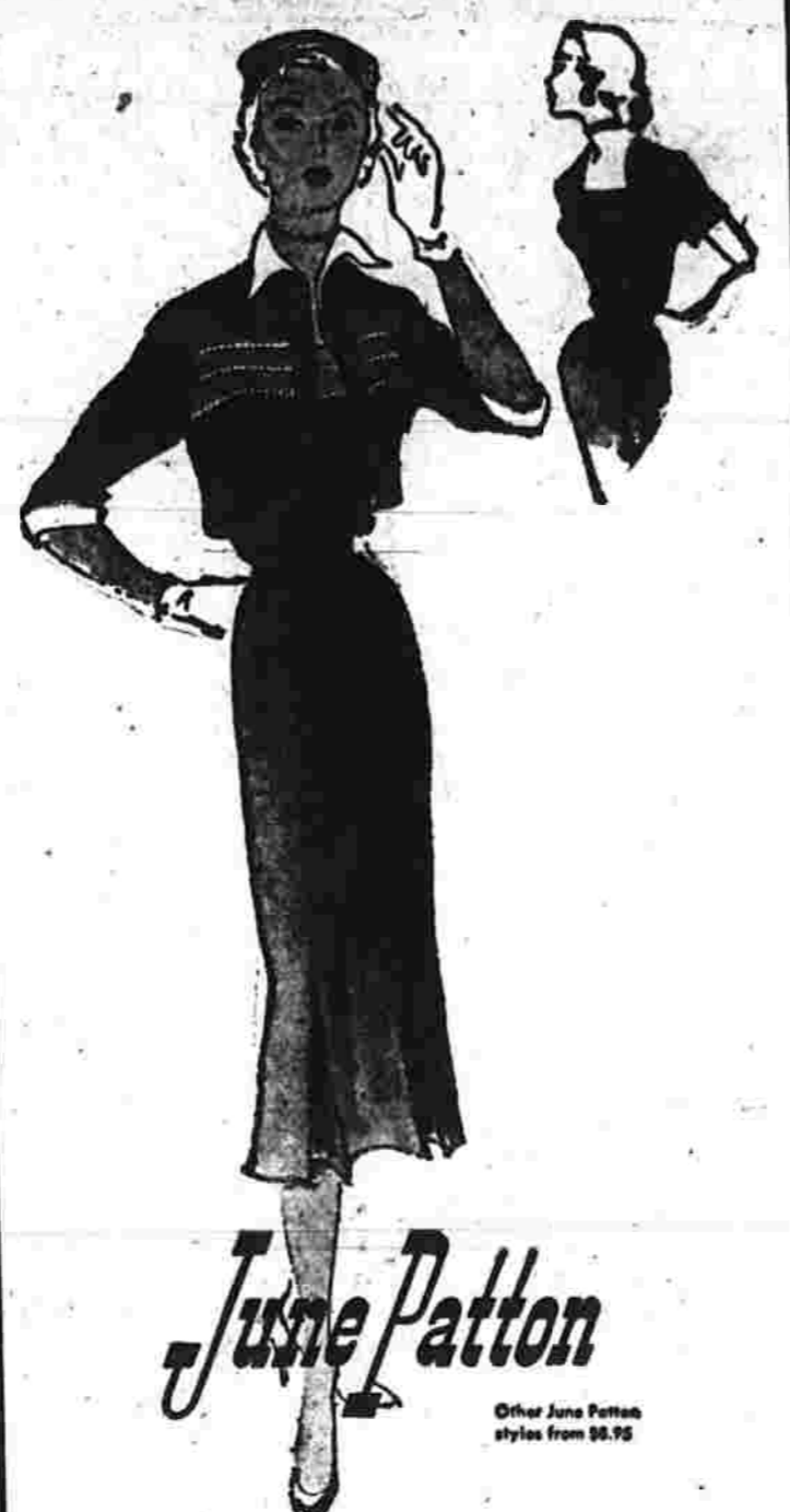
Aggonging over colored-lining details the square-yoked dress and curved bolero which is fully color faded, Rayon crepe in Navy/Lime, Frost Grey/Tangerine, Black/Silken Gold.

Washington, Jan. 27.—(AP)—Secretary of State Acheson has assured Congress that American-French talks starting here Monday were not intended to enter into any formal agreement. Acheson said that the talks were merely exploratory and that the United States would not be bound by any agreement reached in Paris. He said that the talks were necessary to discuss the situation in the Far East arising out of the Korean and Indo-China Communist fighting.